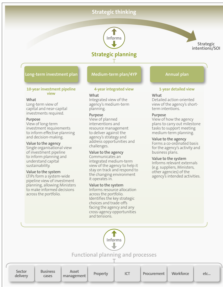
Figure 1 Relationships between different strategic planning outputs

Source: Adapted from the Treasury (2016), Guidance for Developing and Maintaining a Long Term Investment Plan , page 22.